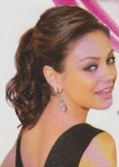
BRIGHT AND SEXY GLOSS Gvenchy Gele d'Interdit in Explosive Raspberry (#27, sephora.com )